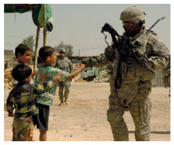
A 2/25 Stryker Brigade Combat Team soldier greets Iraqi children. Engaging with the local population and treating the people respectfully helps win their trust and cooperation.

In order to conduct deliberate consequence management, you have to plan how to deal with mistakes, such as damaging property, injuring or killing an innocent civilian, or detaining innocent personnel-all of which can be used by the enemy as examples to the population that U.S. and Coalition forces are not the answer to their problems. A technique I've seen work is to designate a reserve force with a priority of planning to act as a consequence management team. This force is task-organized with assets such as PAO/media, medical services, civil affairs, counter-IED teams, engineers, interpreters and-most importantly-some type of hostnation force and government representation. A properly task-organized element that continues to ask the "what if" question has the ability to engage with the local population immediately and accurately before the incident degrades any possible success the mission could have had.