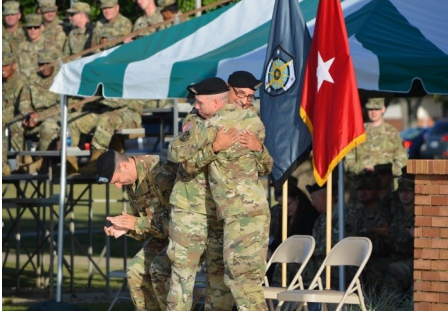
2nd Battalion bids a fond farewell to its first Senior Enlisted Leader on 05 October 2017 on Barton Field.